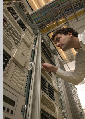
Orion Group Engineers have over 70 years experience operating in virtually every network environment

and our comprehensive and professional approach signifies our belief in becoming your IT department. By optimizing your network's performance, it will work at the peak efficiency and reliability levels that your business demands, allowing you to focus on running your business, not your net-